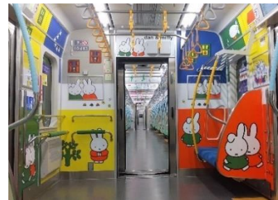
miffy and dan © Mercis bv