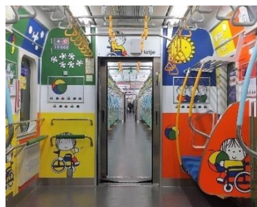
lotje © Mercis bv