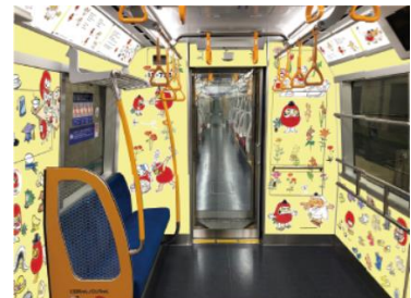
Daruma-chan and Tengu-chan